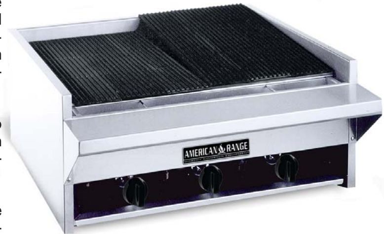
SHOWN WITH OPTIONAL STAINLESS STEEL LANDING LEDGE

All our quality counter appliances come standard with a stainless steel exterior and the best warranty in the business. Look to American Range for innovation, reliable performance, quality and attention to your equipment needs and delivery, now and in the future.